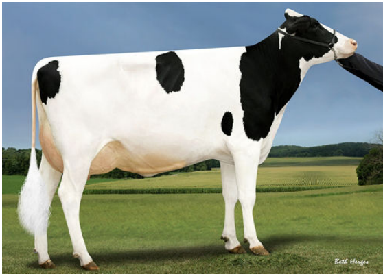
SANDY-VALLEY MD PLEASURE THIRD DAM