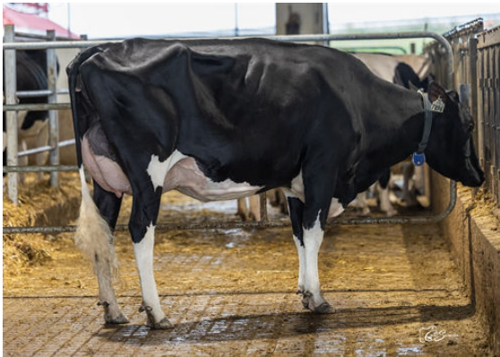
CHARACTER ANGLE PERFECT DAUGHTER