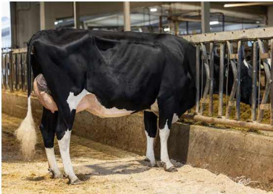
CHARACTER ANGLE PERFECT DAUGHTER