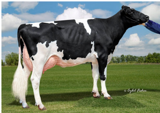
AOT MARK HIGHSTRUNG DAM