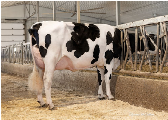
PROGENESIS PERKY PEPITA DAUGHTER