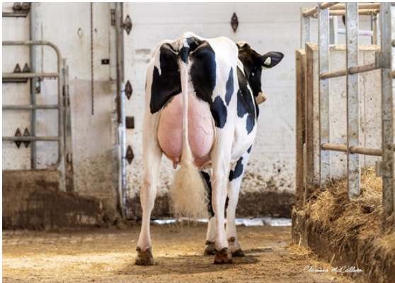
PROGENESIS PERKY PEPITA DAUGHTER