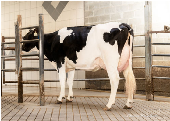
PROGENESIS WC FOUNDATION 15995 DAUGHTER