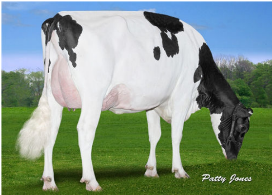
CLAYNOOK FABBY SILVER FOURTH DAM