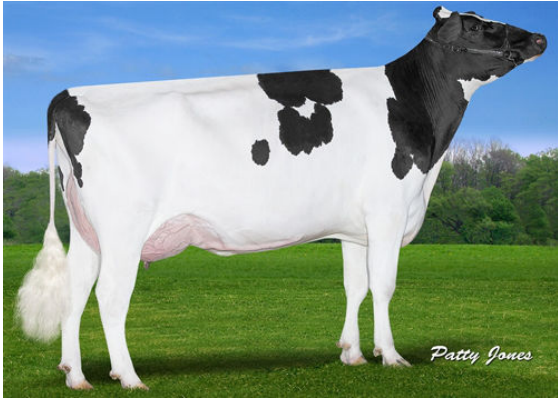
CLAYNOOK FABBY SILVER FOURTH DAM