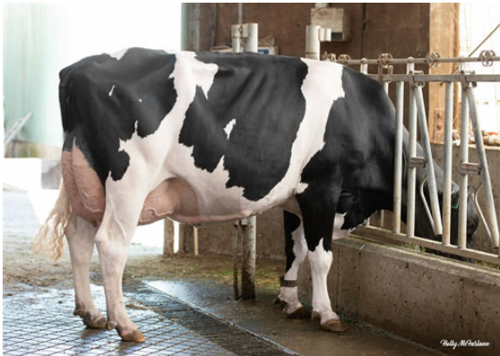
PROGENESIS YODA PALOMA GRANDDAM