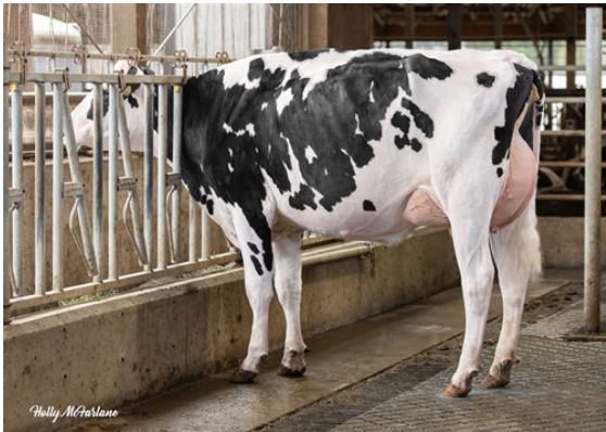
PROGENESIS MIRAND HOTSTUFF P DAM