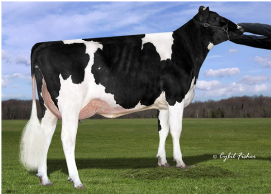
SIEMERS DENVER PARIS GRANDDAM