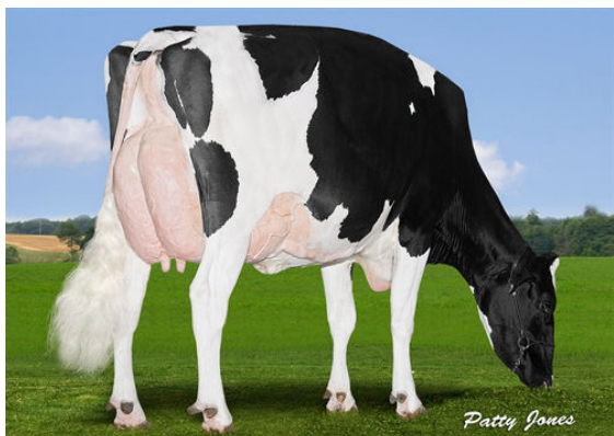
HULSDALE B SCIENCE MALAKI P GRANDDAM