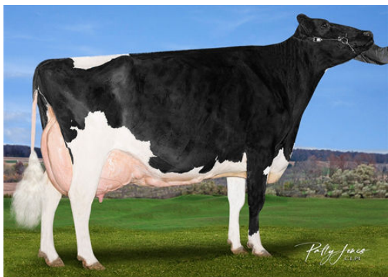
HULSDALE B WINDBROOK MAHALO THIRD DAM