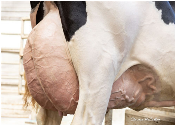
PROGENESIS ZAZZLE PRESTIGE DAM