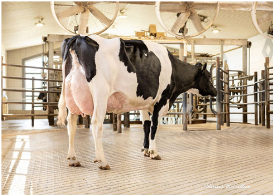
PROGENESIS ZAZZLE PRESTIGE DAM