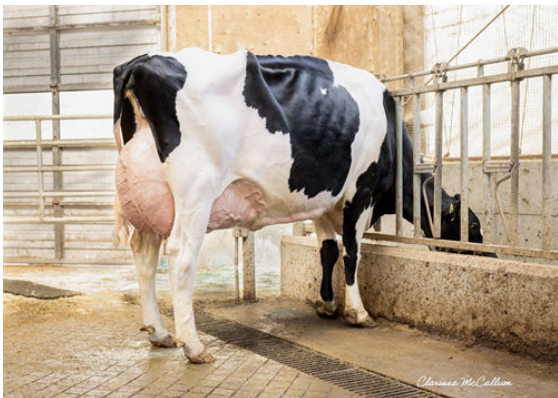
PROGENESIS ZAZZLE PRESTIGE DAM