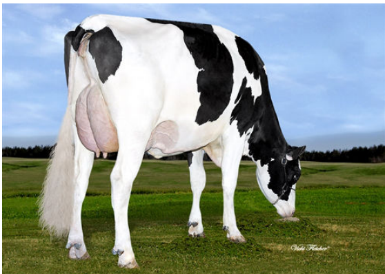
BLONDIN TJR BOMBERO MAPLE FOURTH DAM