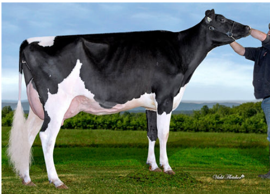
FEPRO PERFECT LINDOR DAM