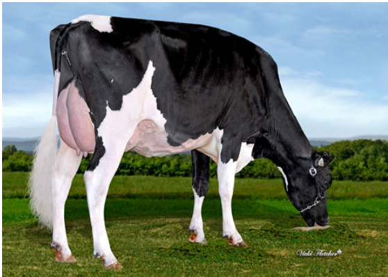
FEPRO PERFECT LINDOR DAM