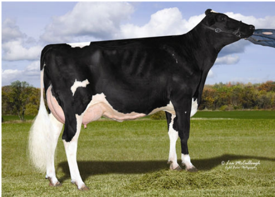
COOKIECUTTER MOM HALO FIFTH DAM