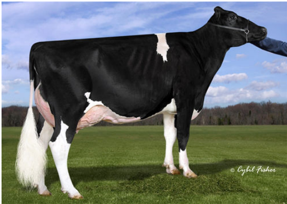
VIEW-HOME MRDIAN IOWA FIFTH DAM