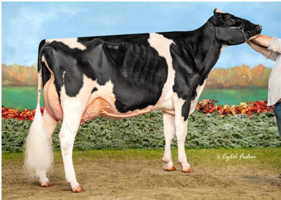
S-S-I DOC HAVE NOT 8783 FULL SISTER TO DAM