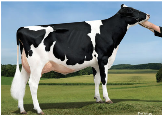
SANDY-VALLEY BL PARADISE FIFTH DAM