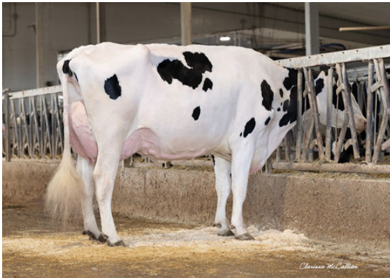
WALNUTLAWN LAMBDA BRIGHT DAM