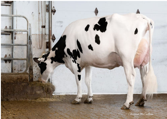
WALNUTLAWN LAMBDA BRIGHT DAM