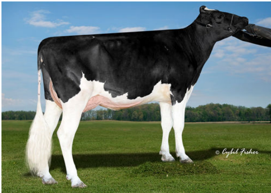
SHELAND REFLECTOR BRIGHT FOURTH DAM