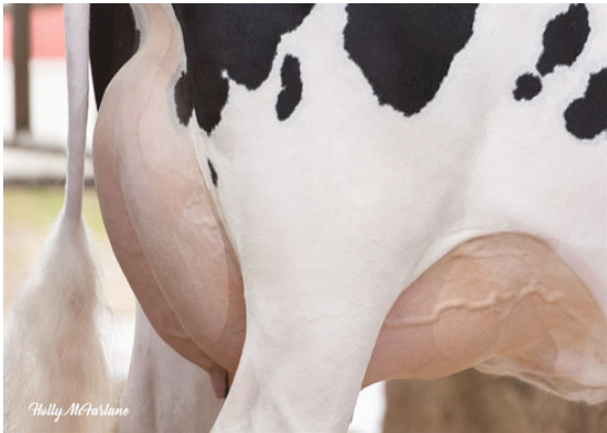
COOKIECUTTER A HOMILY GRANDDAM