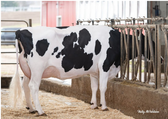
COOKIECUTTER A HOMILY GRANDDAM