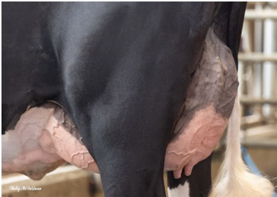
PROGENESIS CHAMPION PALAZZO DAM