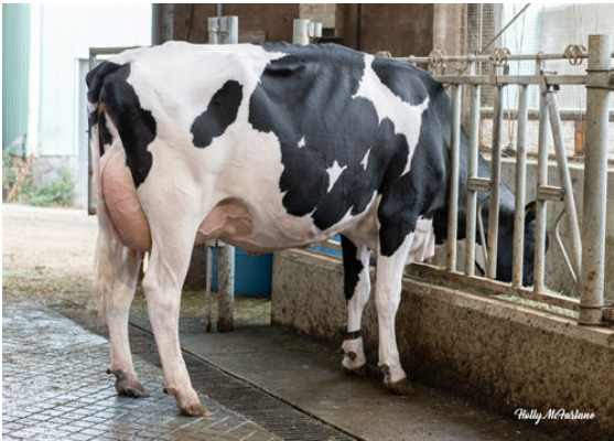
PROGENESIS ZAZZLE MEEKO GRANDDAM