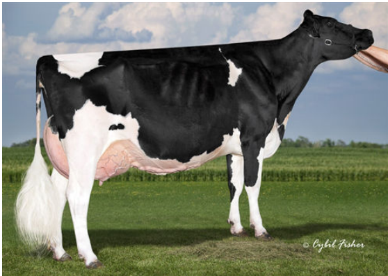
COOKIECUTTER MOG HANKER FIFTH DAM