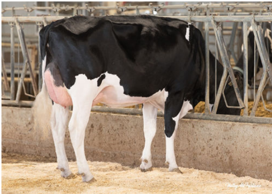
PROGENESIS RANGER LENNON DAM