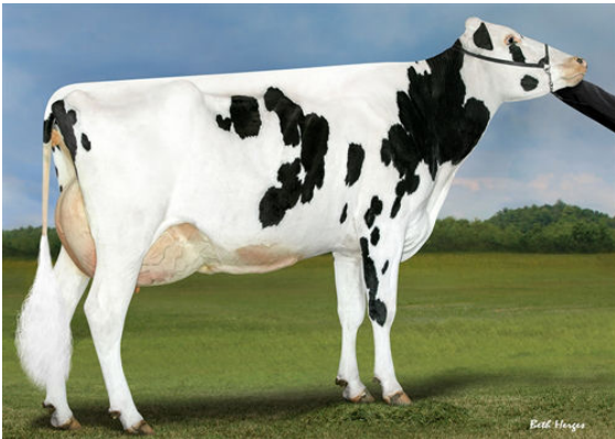
PROGENESIS DUKE MELEE FIFTH DAM