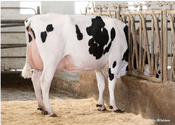
PROGENESIS PYRAMID MOLINA THIRD DAM