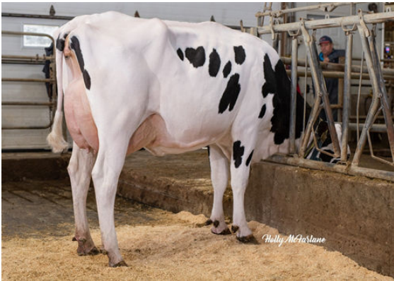
PROGENESIS TOPNOTCH MACIE FOURTH DAM