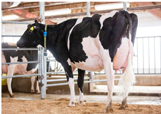
SIEMERS LSTR HANAN 33317