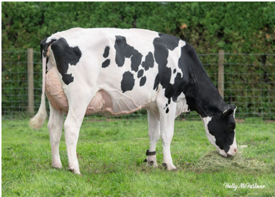
VOGUE LIMELIGHT ANGEL EYES-PP GRANDDAM