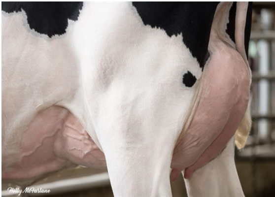
TERRA-LINDA MGNM FIERCE DAM