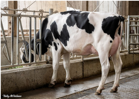
TERRA-LINDA MGNM FIERCE DAM