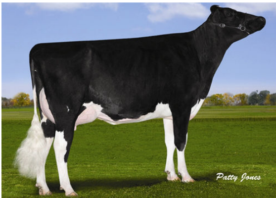
FREUREHAVEN FGS LUCY THIRD DAM