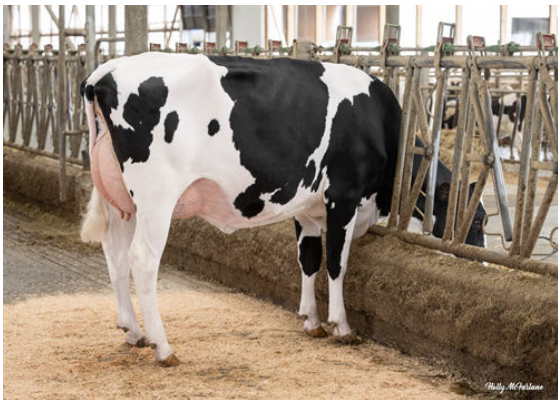
WALNUTLAWN DESTINATION LOVE DAM