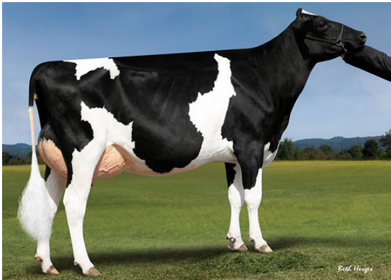
OCD JEDI TAYA 37904 FOURTH DAM