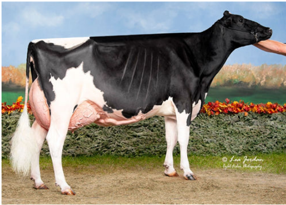
KINGS-RANSOM CASP DAZE GRANDDAM