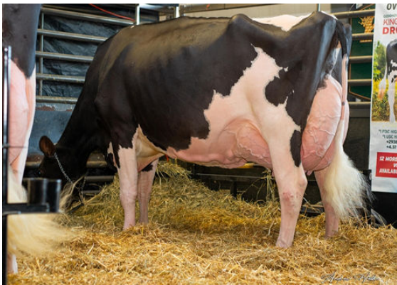
KINGS-RANSOM CASP DAZE GRANDDAM