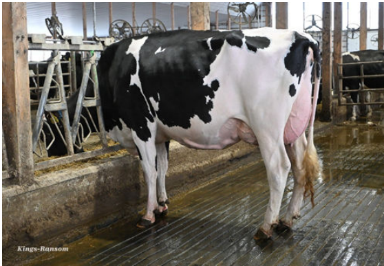
KINGS-RANSOM HAPPN DABBY DAM