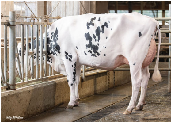
PROGENESIS RANGER PARADISE GRANDDAM