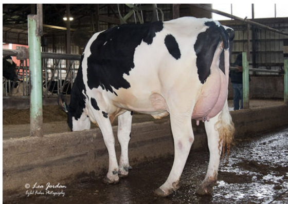
OCD BURLEY FRANCES 41330 FOURTH DAM