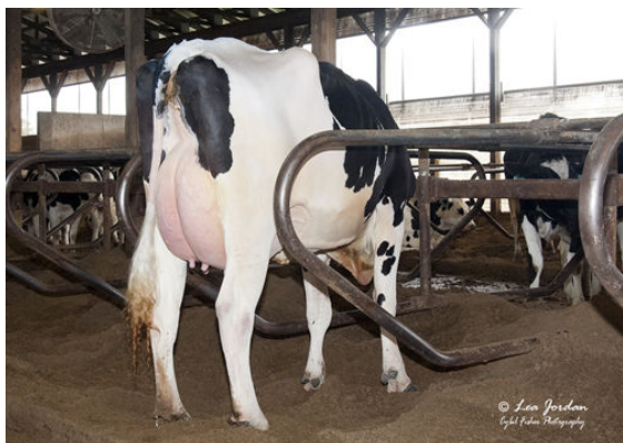
OCD BURLEY FRANCES 41330 FOURTH DAM