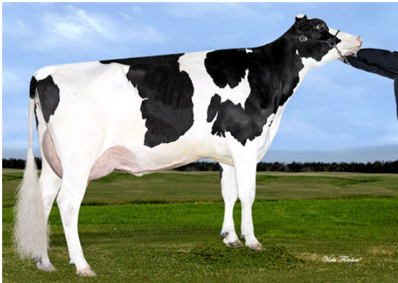
BLONDIN TJR BOMBERO MAPLE FOURTH DAM