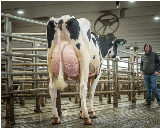
OCD WHEELHOUSE RAE 68559 DAM