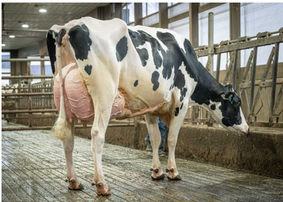
OCD WHEELHOUSE RAE 68559 DAM