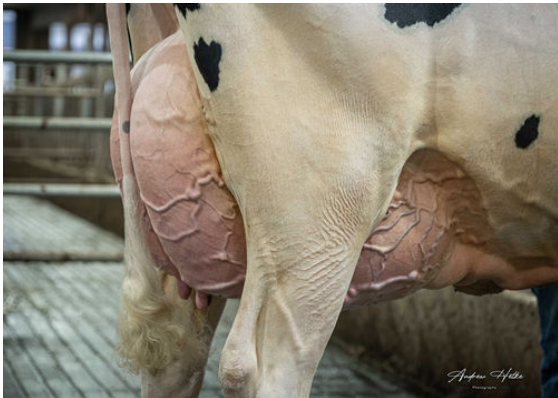
OCD WHEELHOUSE RAE 68559 DAM