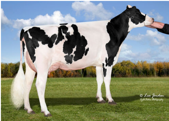
COOKIECUTTER SLM HOPLITE FOURTH DAM