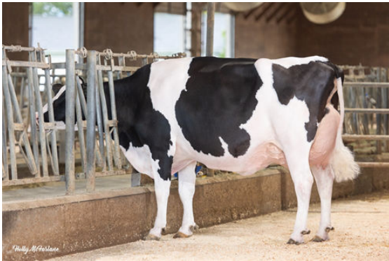
MYSTIQUE LAMBDA ANIS THIRD DAM