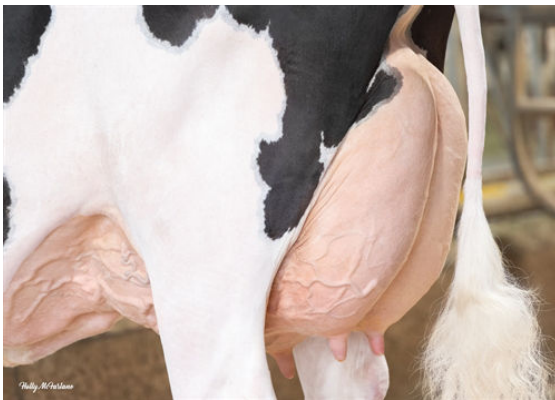
MYSTIQUE LAMBDA ANIS THIRD DAM