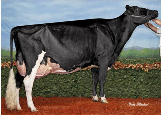
JACOBS GOLDWYN BRITANY FOURTH DAM