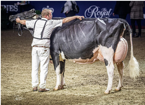
JACOBS HIGH OCTANE BABE THIRD DAM