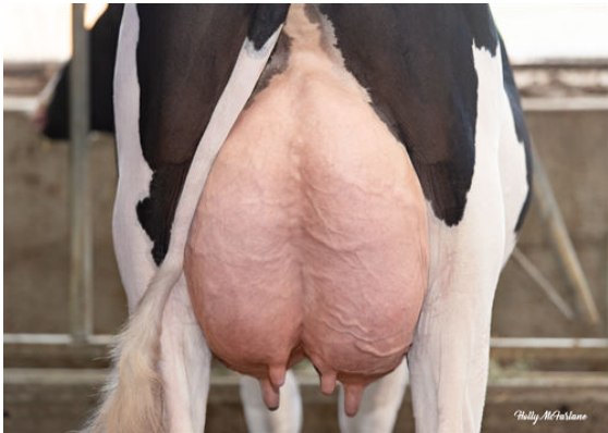
PROGENESIS GAMEDAY TITANIA GRANDDAM