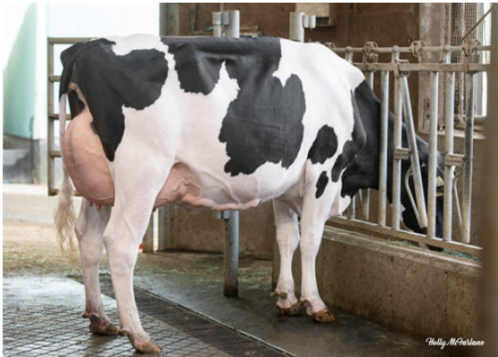
PROGENESIS GAMEDAY TITANIA GRANDDAM