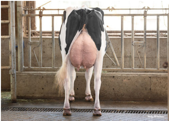
PROGENESIS GAMEDAY TITANIA GRANDDAM