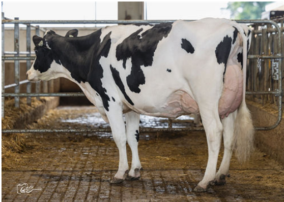
VAL-BISSON RANGER MUSIQUE GRANDDAM