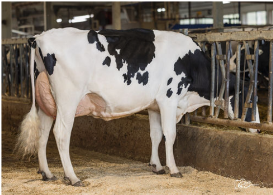
VAL-BISSON RANGER MUSIQUE GRANDDAM