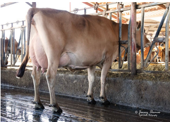
PROGENESIS MARAHUTE DAUGHTER