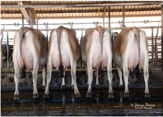
TENPENNY DAUGHTER GROUP L TO R - PROGENESIS MARACHUTE, JX VIERRA NOI(5), PROGENESIS DOROTHY, PROGENESIS MARYPOPPINS