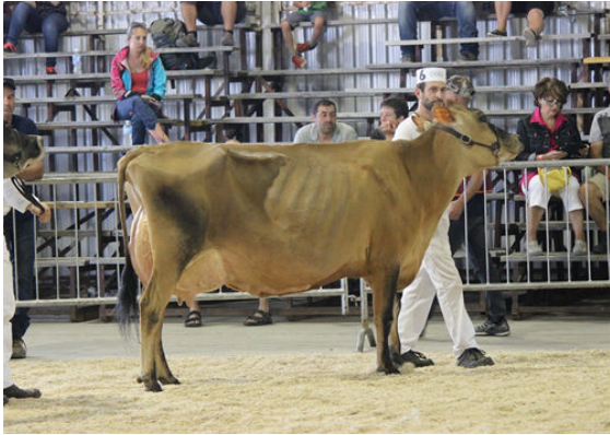
ST-LO TOPEKA DARLIA DAM

AHLEM KWYNN RESPECT ST-LO TOPEKA DARLIA EX-92-5YR-CAN HEARTLAND MERCHANT TOPEKA ST-LO SULTAN DARLINE VG-86-2YR-CAN 4* SHF CENTURION SULTAN NORVAL ACRES LAD DARLENE EX-90-3E-CAN 5*