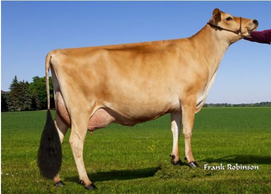
PROGENESIS MADISON- DAM

JX VIERRA SINATRA (4) PROGENESIS MADISON EX-90%-3YR-USA JX RIVER VALLEY CHIEF (6) RACHELLES VICEROY LOUISE VG-88%-6YR-USA CDF VICEROY RACHELLES GENOMINATOR 7857