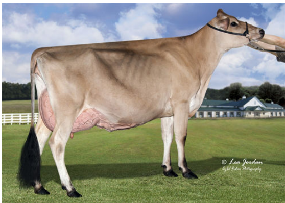
JX RIVER VALLEY ENZO MACNCHEZ 6612 {4} GRANDDAM