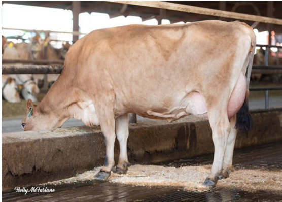
JX PROGENESIS MINNIE {5} DAM

JX PROGENESIS MONARCH {5} JX PROGENESIS MINNIE {5} VG-84%-4YR-USA JX VIERRA SINATRA {4} PROGENESIS MADISON EX-92%-5YR-USA JX RIVER VALLEY CHIEF {6} RACHELLES VICEROY LOUISE VG-88%-6YR-USA