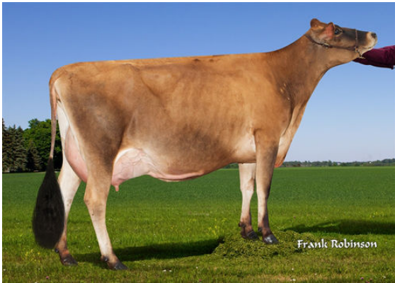
JX PROGENESIS CINDERELLA {6} DAM