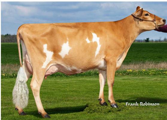
PROGENESIS CRAZE CORD {6} GRANDDAM