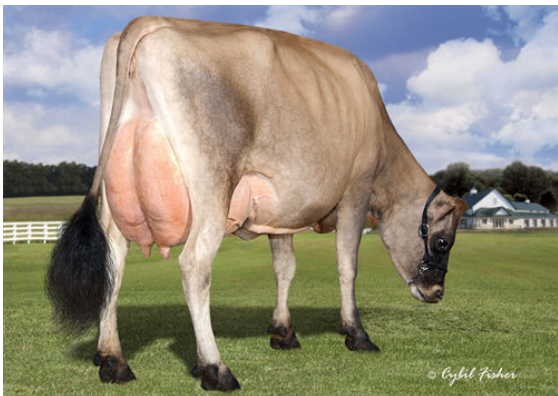
GOFF PHAROAH CIRCUS ACT THIRD DAM