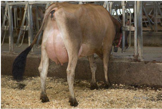
GOFF PHAROAH CIRCUS ACT THIRD DAM