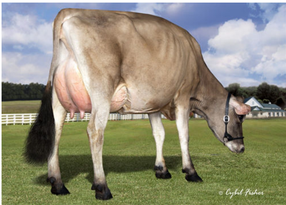
JER-Z-BOYZ MACNCHEZ 48947 GRANDDAM