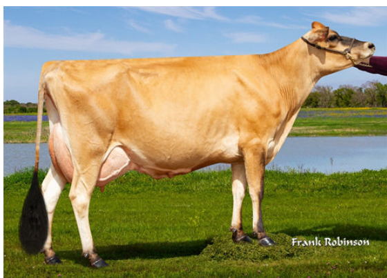
PRO-HART CHROME LORETTA {6} GRANDDAM