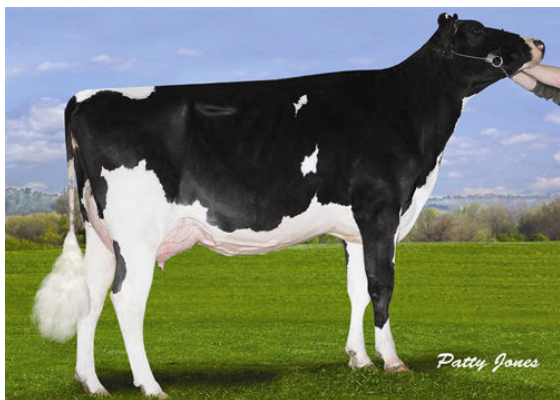
MS LOOKOUT PESK BKM BRIA THIRD DAM