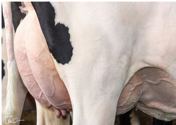
PELLERAT PATTERN 5955

L TO R - PELLERAT PATTERN 6642, 5958, 5964 AND 5955