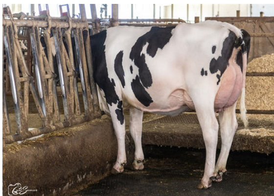
PELLERAT PATTERN 5955